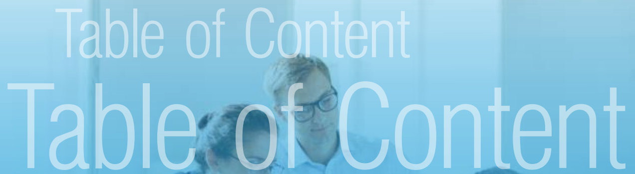
Table of Content Table of Content Table of Content